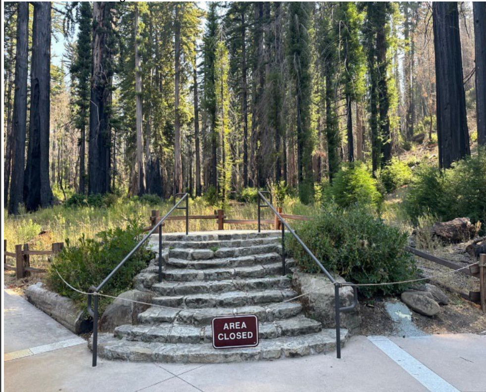
P5a. Photo or Drawing