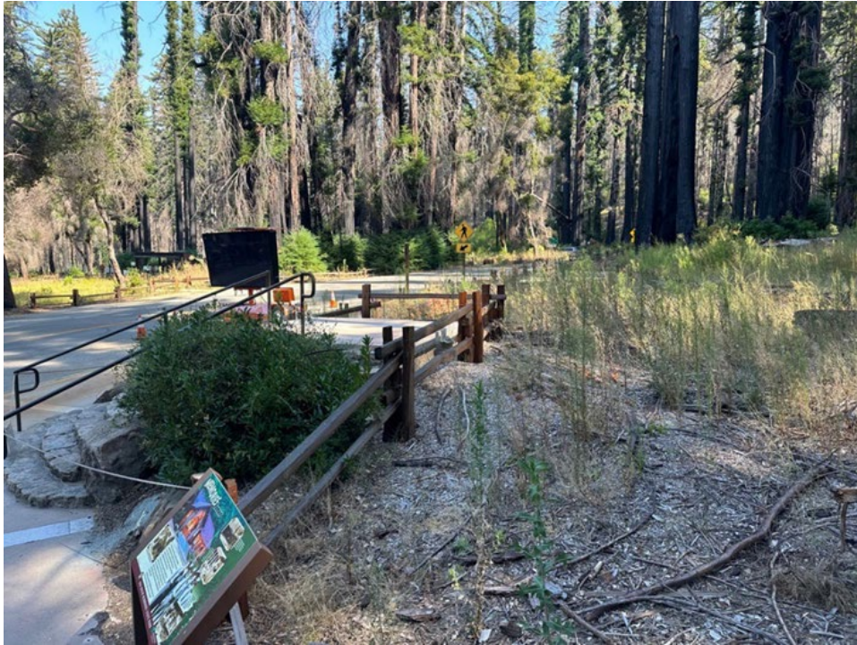
Photo 3 Concrete patio and steps, view northwest