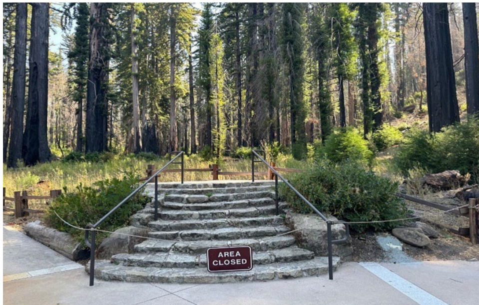
Photo 2 Concrete patio and steps, view south

Photo 1 Headquarters Administration Building steps, view northeast